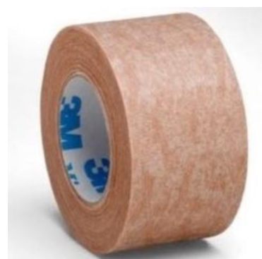
3M Micropore Skin Tone Surgical Tape